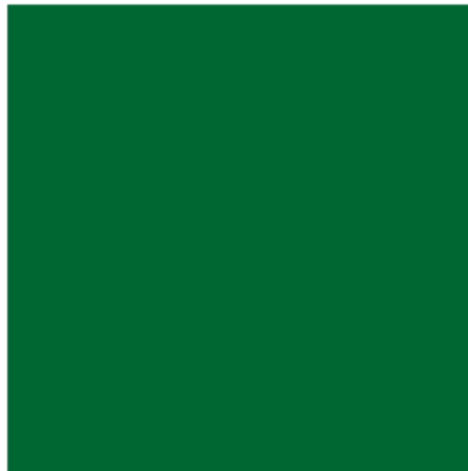
VATWA "Cadmium Green"